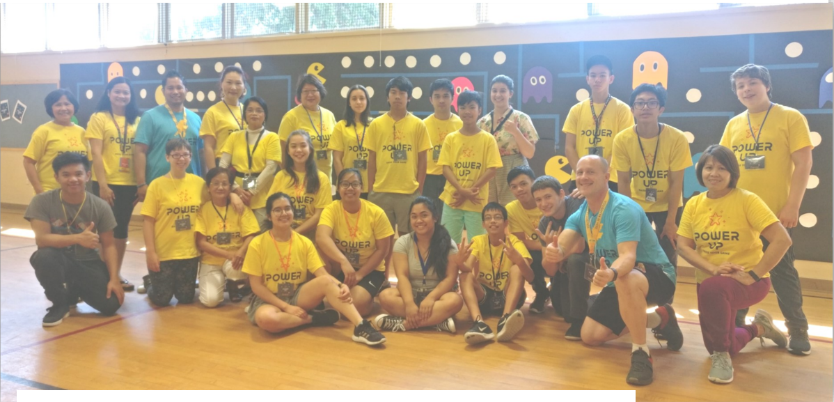
Kids Bible Adventure Week and SERVE helpers July 18, 2019

Big Thank You to all those have helped with the Kids Bible Adventure Week & SERVE+.