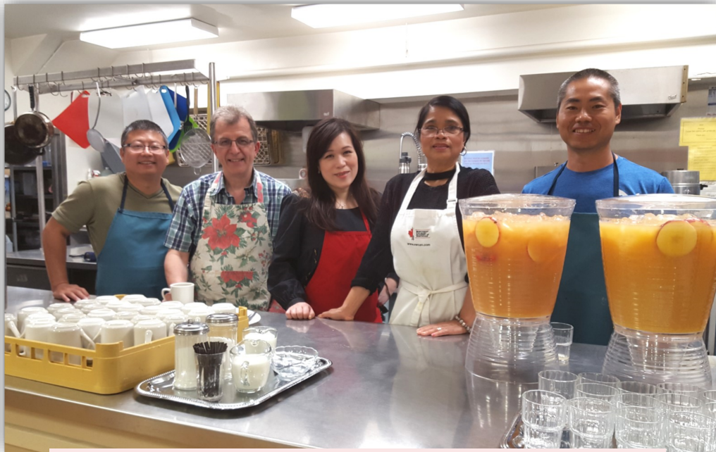
WNL Kitchen Team